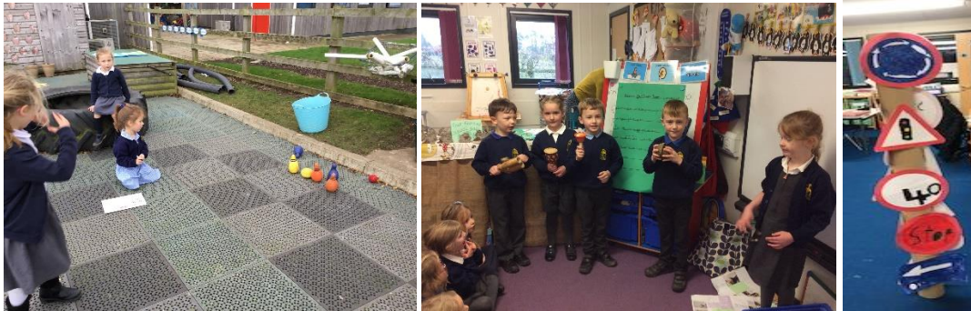
Fountains loved learning the actions to The Green Cross Code and making their own road signs for National Road Safety Week.

Byland have been enjoying their science and making up their own songs about different materials and their properties. The Reception children have loved learning how to take away through playing games such as skittles.