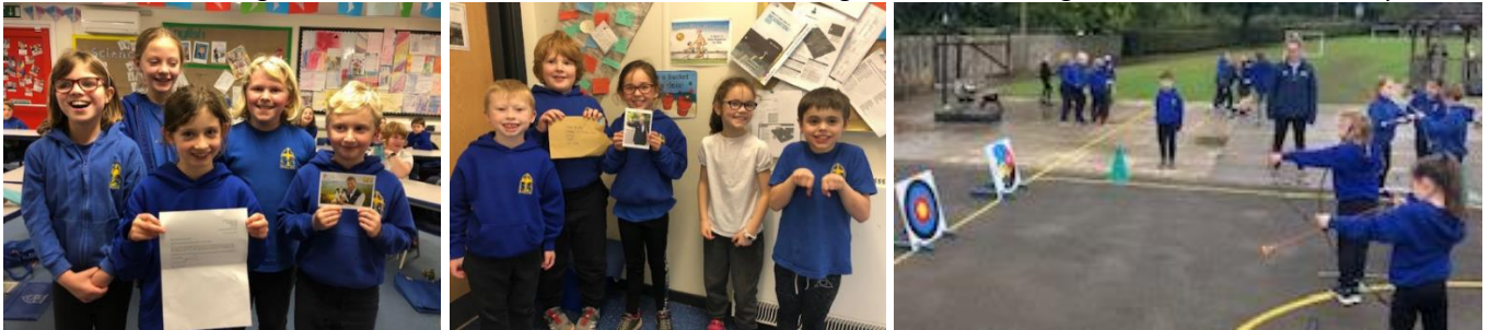
Bolton are really enjoying their English, biographies topic. They have written letters to inspirational people from Yorkshire and were very excited to receive a phone call and two wonderful letters in response! They have also enjoyed trying a new sport 'Archery' and have entered the NYCC school's virtual competition this term.