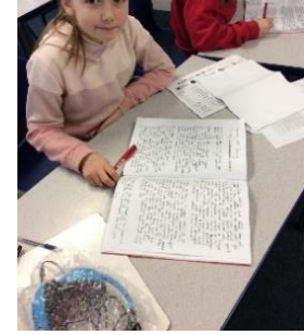
We enjoyed writing our Egyptian Fairy tales. Some lovely descriptive writing done by all.